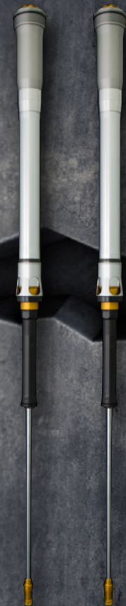
TTX 22 CARTRIDGE KIT