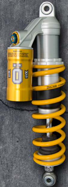
STX 46 SHOCK ABSORBER