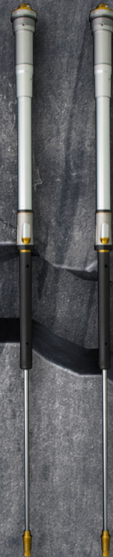
STX 22 CARTRIDGE KIT