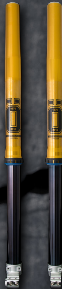
RXF RACING FRONT FORK

Tailor made for you! We have the perfect part for your bike, delivering outstanding performance at a competitive price. Öhlins manufactures more than 300 different shock absorber models, every one uniquely fitted to your bike and suited to fit without interfering. We make sure that the product behaves the way it should, through the design of the shim stacks and valves as well as the calibration of the adjusters. This is no guesswork. We try the settings out, in real life, and adjust them until everything works perfect for each and every specific model. Then we assemble the products with utmost precision to ensure superior control of the damping force. That is the key to our success.