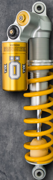
TTX 30 SHOCK ABSORBER