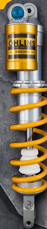
TTX FLOW SHOCK ABSORBER